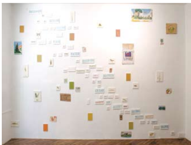
The Best I Can Do , 2006 Installation Dimensions variable Courtesy the Artist

Bloom Projects: Blaise Drummond, The Best I Can Do